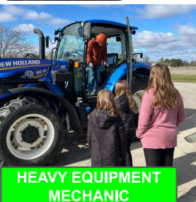
HEAVY EQUIPMENT MECHANIC